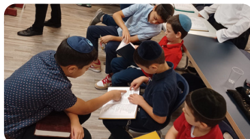
1st grade joins the Rosh Chodesh Hallel with the help of their older peers!