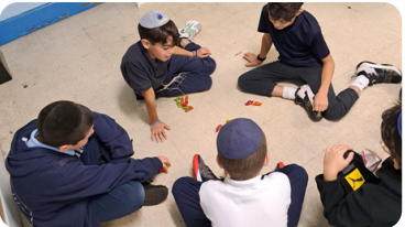
The boys division competes in a Dreidel Olympics game!