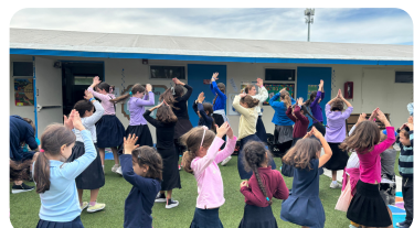
The girls division has a Chanukah dance party and musical performance!