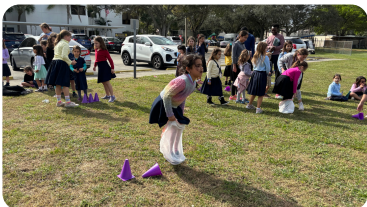
Team building Maccabi Relay Races!