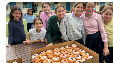
Enjoying delicious jelly donuts in honor of Chanukah!