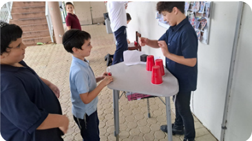
Student-led Chanukah carnival!