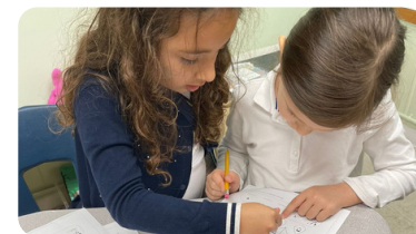
1st grade works in pairs on their grammar worksheets!