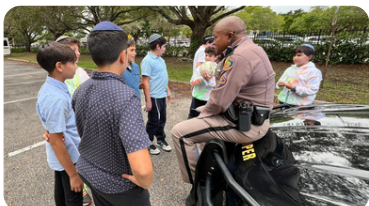
7th grade learning about safety from our state trooper!