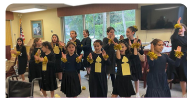
Upper Elementary girls preformed for the residents of a local nursing home!