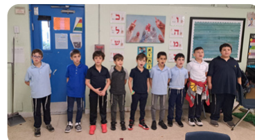
2nd grade boys rehearsing for their incredible performance!