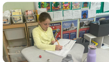
Using a dreidel to learn about science and math in 4th grade!