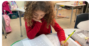
2nd and 3rd grade practicing their Kesiva skills!