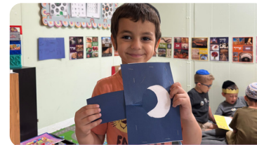
Parsha creations in Morah Liatt's Kindergarten class!