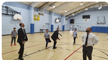
7th grade boys take on their Rebbeim in a game of 3-on-3!