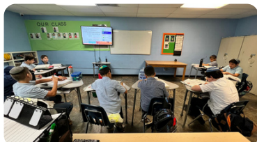
7th grade working hard in their math booklets!

NEVER TOO LATE: Yosef's brothers regret having sold him as a slave and are willing to redeem him at all costs (Rashi 42:3). It had been twenty-two years since that sale. It was a decision that was rendered by the greatest and most brilliant Torah personalities and based upon what they truly felt was the correct thing to do. Imagine the depth of their conviction and the many years that they lived with that decision. Yet, they were willing to regret and go back on that decision, and as a result, change the course of history. It is never too late! May we hear only good news from Eretz Yisroel. Have a wonderful Shabbos.