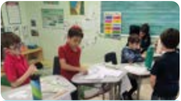
2nd grade learns about money by creating their own businesses!