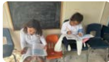
1st grade working in partners on their grammar assignments!