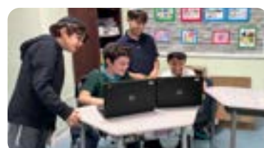
4th grade working on their i-ready math games together!