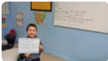
1st grade practices their spelling words!

TORAH: CAN'T LIVE WITHOUT IT! When Yaakov and his family traveled to Mitzrayim, he sent Yehuda ahead to set up a yeshiva in advance of their arrival so that it will be ready for them when they get there (Rashi 46:28). One might wonder. "What's the big rush? When they arrive, they can build a yeshiva? The message of the Torah is clear. When it comes to Torah study, there can be no delay, because when it comes to Torah, you can't live without it! May we hear only good news from Eretz Yisrael. Have a wonderful Shabbos.