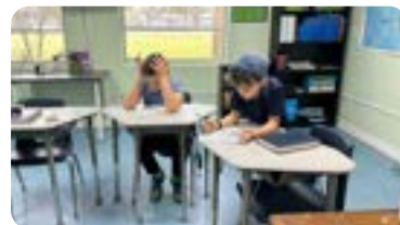
4th grade working on their English assignments!