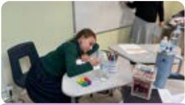
Learning new Algebra skills in 6th grade!