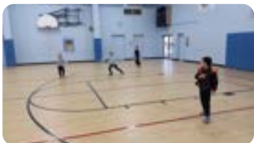
Team-building football game in 1st grade!