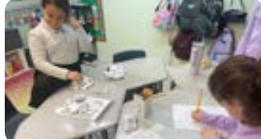
4th grade works on their math activities using the Derech Eretz money they earned!