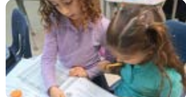
2nd and 3rd grade works on their math worksheets!