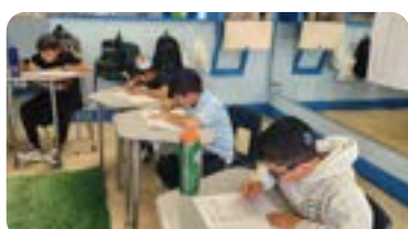
Learning Grammar in 5th grade!