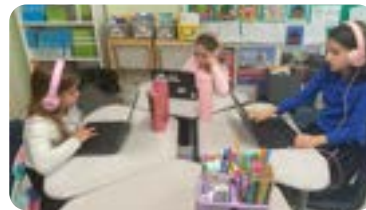
4th grade working hard on their i-ready assessments!