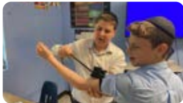
The 8th graders teach the 6th graders how to put on Tefillin!

"RESULTS ARE UP TO HASHEM": After Yaakov requests of Yosef to be buried in Canaan, Yosef responds and says "I will do as you say" (47:30). The Seforno explains that what Yosef really meant to say is "I will do the best I can to fulfill your wishes". The lesson of the Seforno is that one can only control his efforts , but the results of those efforts are up to Hashem. A good quotation to remember is " plans are man's, but the odds are G-D's. " May we hear only good news from Eretz Yisroel and have a wonderful Shabbos.