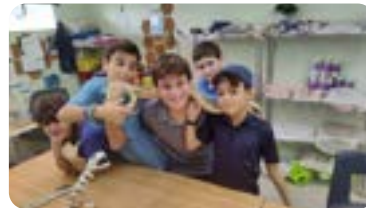
4th grade learning about our snakes in zoology!