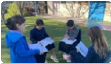
4th grade takes their davening outdoors!