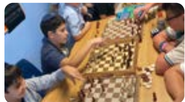
Middle school chess club games!