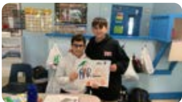
5th grade presenting their Mishna board creations!