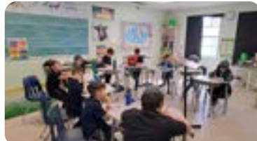
2nd grade learning grammar together!