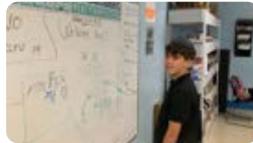
5th grade plays a "guess the picture" game during Chumash class!