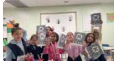
1st grade completes another Aleph Champ workbook!