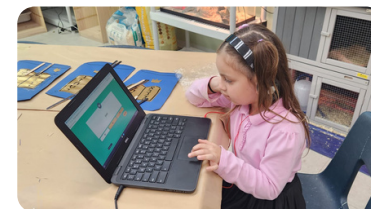
Practicing math and reading skills with i-Ready!