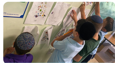
2nd grade working hard on their treasure charts to earn their well-deserved prizes!