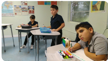
3rd grade practicing their spelling words!

WHAT TIMING! The very first Rashi on the very first Passuk in the Torah (this Shabbos) states that Hashem began the Torah with the events of creation and not with the first Mitzvah, so that if the nations of the world will say to the Jewish people, "You are bandits, for you conquered the lands of the seven nations and took them as your own land (Eretz Yisrael), the Jewish people will be able to respond to them, " The entire earth belongs to Hashem! He created it and gives it to whomever He feels worthy. He first gave Israel to the Canaanim and then took it from them and gave it to us". What Timing! May we hear only good news, with Hashem's help. Have a wonderful Shabbos.