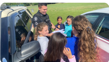
Showing appreciation to our security guards and officers with beautiful cards!