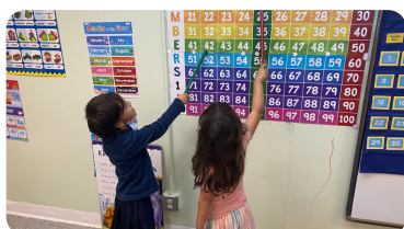
Kindergarten is mastering all their numbers!