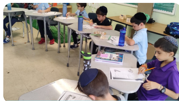
2nd grade hard at work in their grammar booklets!