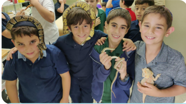
Playing with our snakes in Zoology!