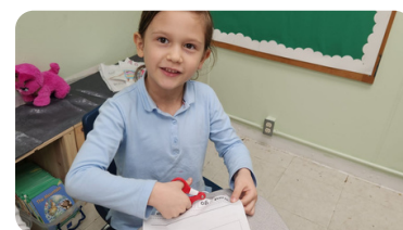
1st grade works on their sight word worksheets!