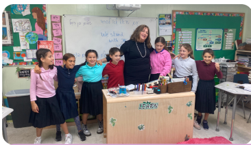
Singing Acheinu together with Morah Levana during davening!