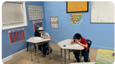
1st grade is hard at work writing out their spelling words!