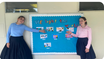
6th grade's artwork for the 6 days of creation in this week's parsha!