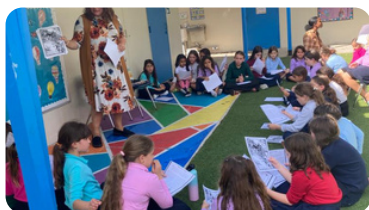
All the girls joined together to recite Tehillim and sing!