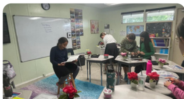
Creative writing presentations in 6th Grade!