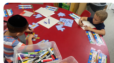
Kindergarten creates kindness puzzles!