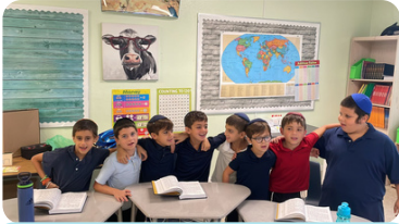
2nd grade gets together to sing Acheinu for Am Yisroel!