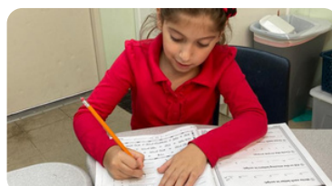
2nd and 3rd grade are hard at work in their Lehavin books!