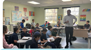
2nd grade joins the 3rd grade class for a beautiful davening!