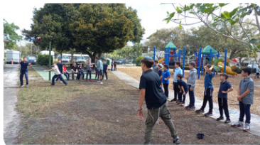
3rd, 4th, and 5th grade joins in on a team building game together!