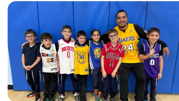
Proudly showing off their Jerseys in the gym with coach!