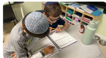
2nd graders pair up as chavrusos to work on their LeHavin skills!