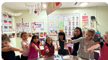
Interactive Parsha learning in Kindergarten with Morah Liatt!