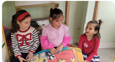
1st grade visits the Kindergarten for storytime!