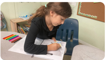
2nd and 3rd grade decorate their beautiful Haggados!