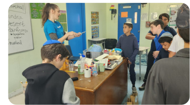
Learning about biomes with our visiting scientists!