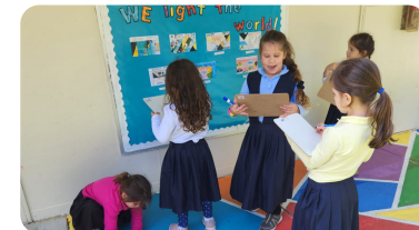
Sight word scavenger hunt!