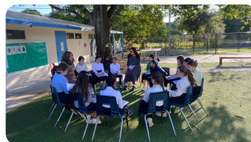
Outdoor Rosh Chodesh Davening!