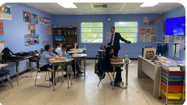
Learning with Rabbi Sacks in 6th grade!

As part of our Achdus initiative, we would like to share an incredible opportunity to be a part of protecting our protectors in Eretz Yisroel!