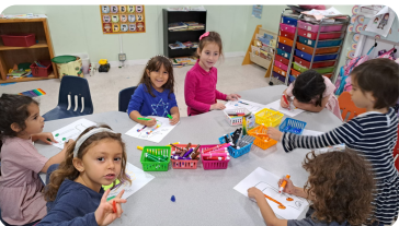
Learning letters in Kindergarten!