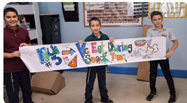
Mrs. J puts a creative spin on classroom rules with 5th grade!