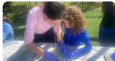
Big sister, Little sister rainbow challah bake for Parshas Noach!