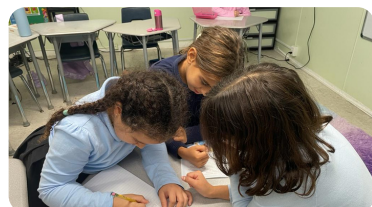
Writing groups in 4th grade!