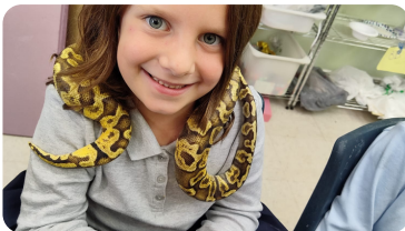
Slithering fun in zoology!