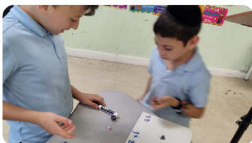
Learning math with dice games in 2nd grade!