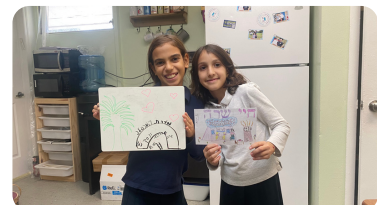
Learning Parsha in 4th grade with beautiful drawings and creativity!