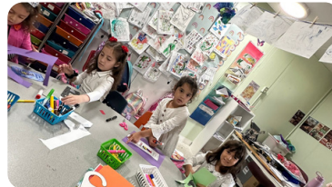
Kindergarten creates Middos projects with Morah Liatt!