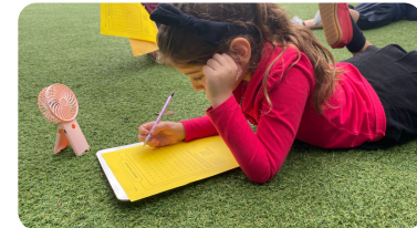
2nd grade girls practicing their spelling words with word searches outside!