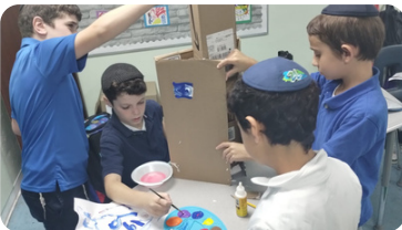
4th and 5th grade engineering rocket ships with everyday materials!