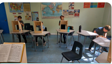
3rd grade davens at their new Shtenders that they built themselves!