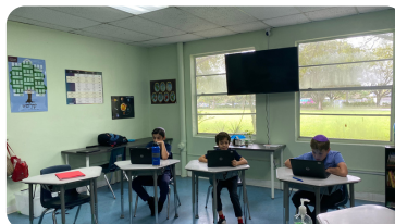
4th grade mastering their math skills in i-ready!