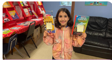
The girls enjoy the last few days of the Scholastic Book Fair!