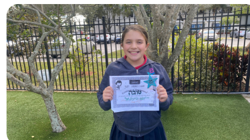
Shoutout to the amazing girls in 6th and 4th grade who completed their Sefer Tehillim!