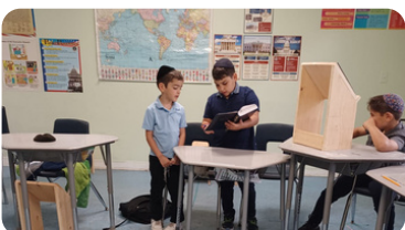
3rd grade boys daven with the 1st grade boys together!