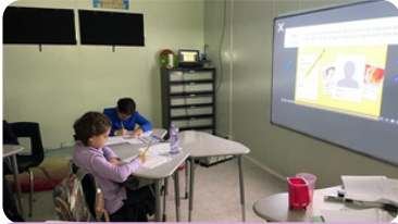
Learning Social Studies in 4th grade with fun video presentations!