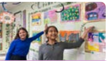
Learning Pirkei Avos and creating beautiful creations in 6th grade!