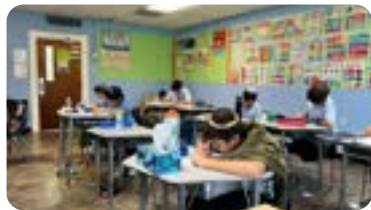
7th grade math review!

KEEP YOUR GUARD UP: Rashi (30:14) wonders why the Torah states that it was during the harvest season that Ruvain picked those special flowers (DUDAIM) for his mother Leah. Do we really care what season it was, the Torah is not a "story book"? Rashi explains that the Torah is praising Ruvain for not taking flowers from private property, for although it was the time of harvest and flowers were in abundance, he collected only from fields that were ownerless. What?! Is the Torah actually praising Ruvain for not being a thief?! Wouldn't that be rather obvious? Rav Moshe Feinstein zt"l explains that the praise is not that Ruvain is not a thief, rather, the praise is that he never ever let down his guard not to steal. He understood that it is possible for even someone great to succumb to the Yetzer HaRa and commit an obvious sin if their guard is down, and for that, he is praised. May we hear only good news from Eretz Yisroel. Have a wonderful Shabbos.