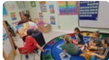
Engaging imagination in Kindergarten during storytime!