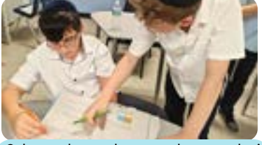
6th grade works together on their math work!