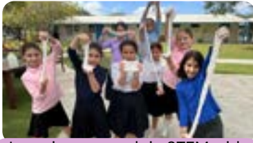
Learning so much in STEM with slime creations!