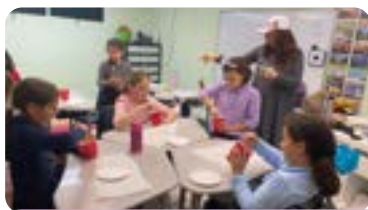
Making cookies in 4th grade to bring the short story they read to life!